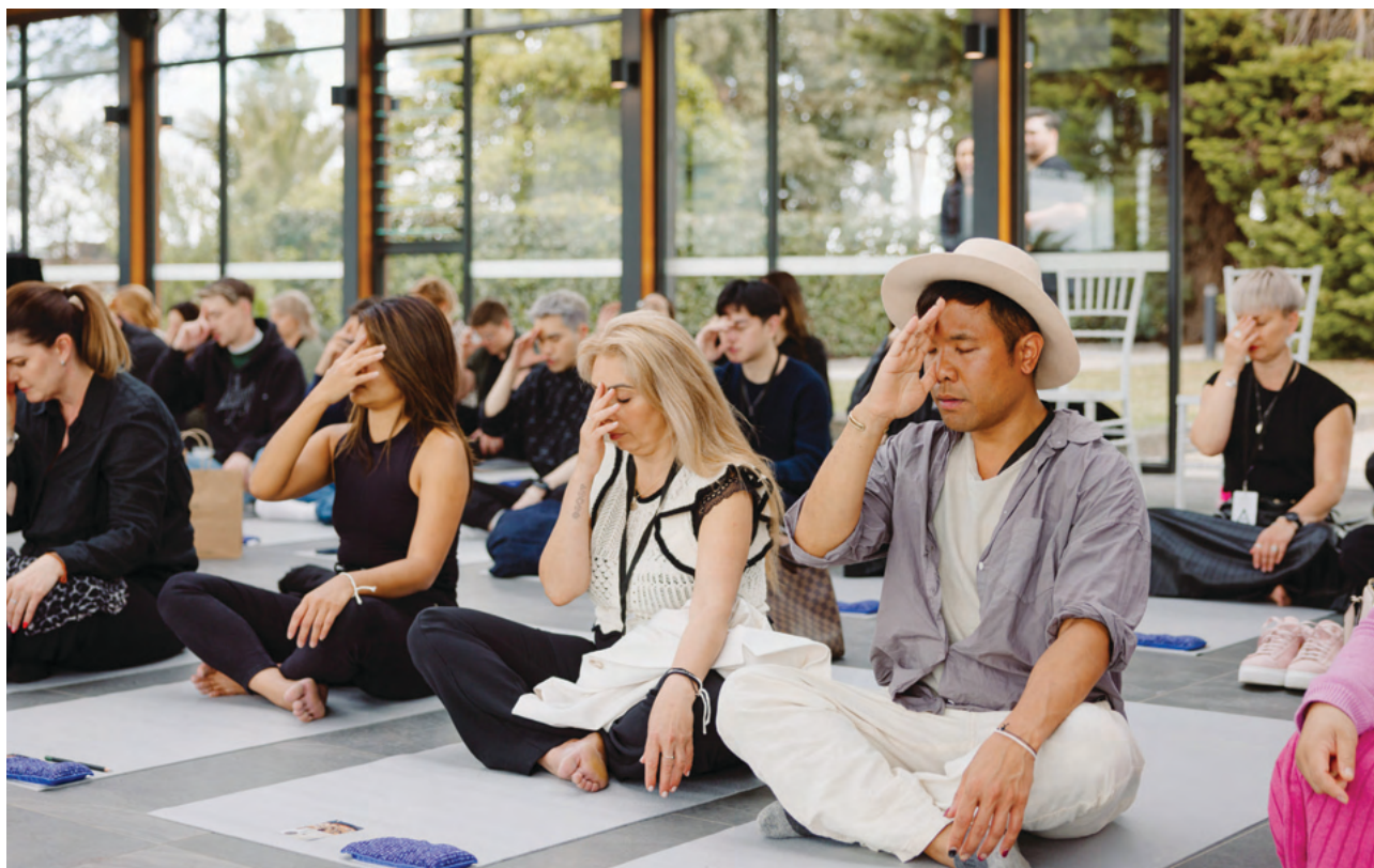
Yoga & Sound Healing