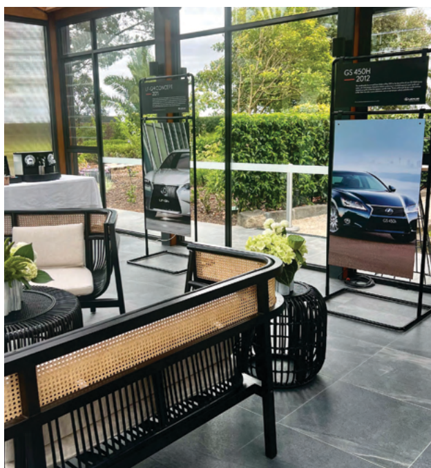
Lexus Media Showcase February 2023