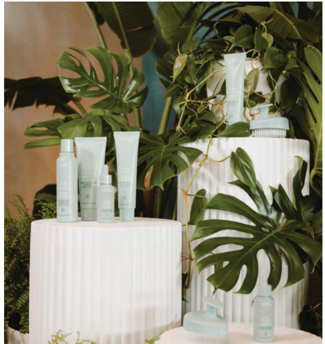
Aveda Artist Retreat October 2023

Speak with our Sales Associates to discuss how we can curate your next product launch for your business.