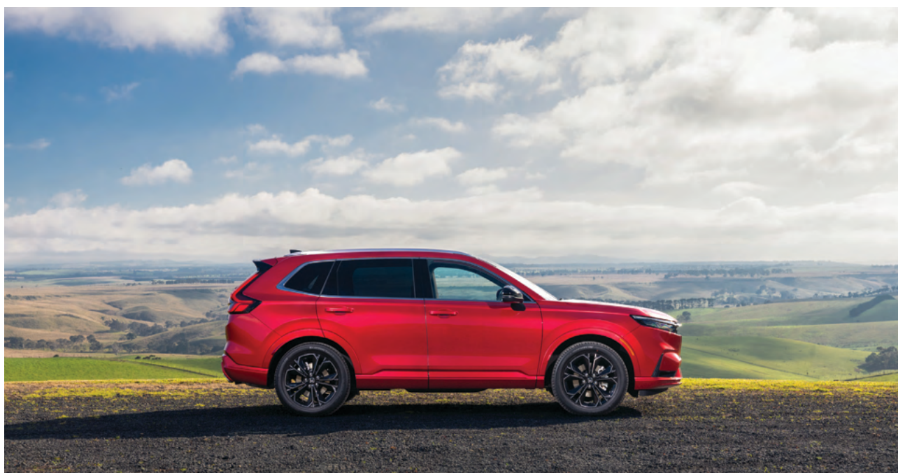
Honda CRV Launch July 2023