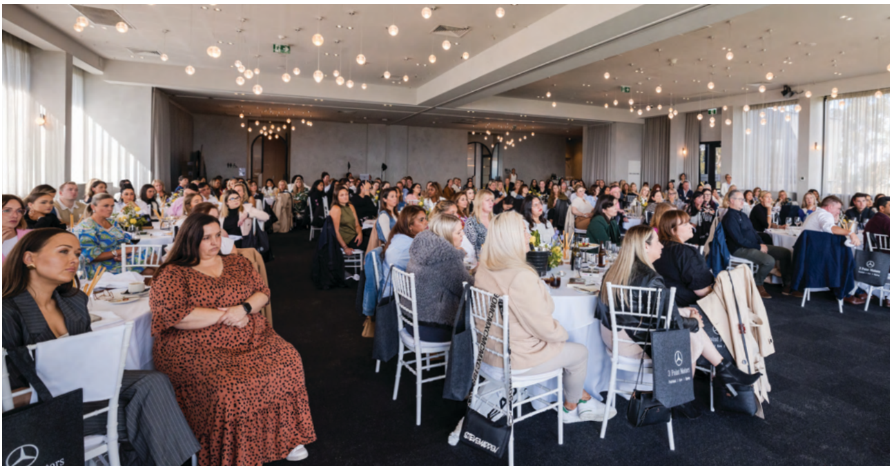
Women In Leadership Luncheon with Jelena Dokic, April 2024