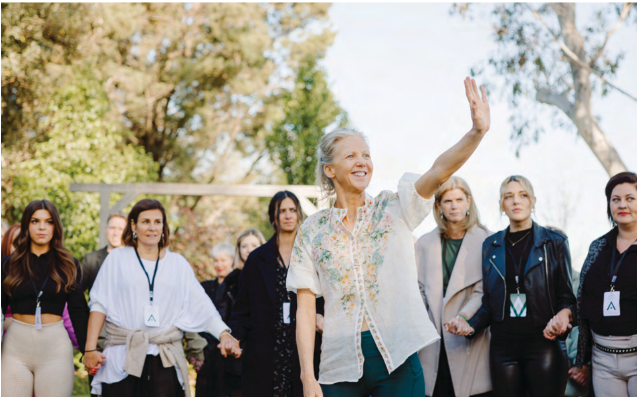
Intention Fire Ceremony