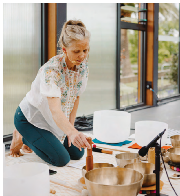
Aveda Wellness Retreat October 2023